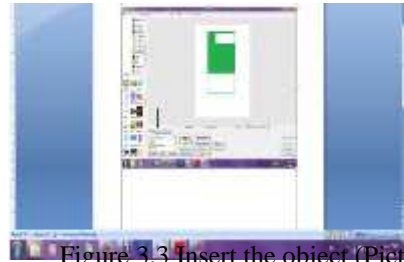
Figure 3.3 Insert the object (Pictures)

4. Editing process was started from inserting the picture. The object inserted through object tool and the location of picture directly appeared.