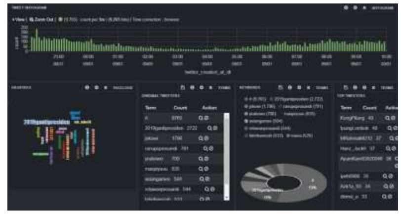
Figure 2. Systems Interface

The competition's nature in politic is similar with the business competition. Both share a basic social media's strategies such as attract new customers, retain them in the business, and make them a loyal customer [8]. Social networks change the nature of political parties from one-to-one interaction to multi channels interactions.