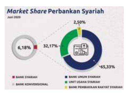
Picture 1. Syariah Banking Market Share

Units, with a total office network of 2,151 units, according to statistics as of December 2014 (Tho'in, 2016). This is quite sad and ironic, where the number of Indonesian Muslims based on the 2010 population census is 207 million (87.2%) but the market share for Islamic banks based on data per June 2020 is only 6.18% (Rohandi, 2020).